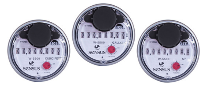
Intelligent Communications Encoder (ICE) Register

AMR / AMI Systems: Meters and encoders are compatible with current Sensus AMR/AMI systems.