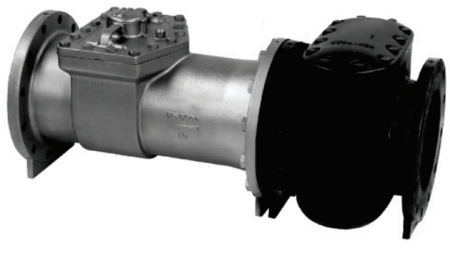
W-5500 DR Turbo Meter with AWWA Strainer

Strainer : The meter comes equipped with an AWWA type strainer and must be installed immediately upstream of the meter. Sensus recommends the use of an approved strainer with this meter.